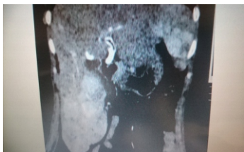
Figure 1 : NCCT showing the liver nodules.

43-year-old lady presented with menorrhagia in the gynecological outpatient department. Ultrasonography & CT (computed tomography) evaluation showed an enlarged liver studded with nodules of fatty and vascular element. This was an incidental finding (FIG-1). Other findings included an intrauterine fibroid. Oesophagogastroduodenoscopy (OGD), colonoscopy and tumor markers were normal. Diagnostic laparoscopic examination of liver, intraoperative U/S examination and guided biopsy of the liver were done. Biopsies were taken from segments 2 and 6 and radiofrequency ablation (RFA) was done to control bleeding from lesion 2. She underwent hepatic segmental resection six months ago (3 years since the biopsy diagnosis) and RFA of the other nodules.