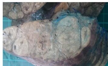
Figure 2 : Cut surface shows multiple nodules.

Gross - Received cores of liver tissue for histopathological examination. The hepatic resection of segments 2 and 3 showed multinodular cut surface, nodules ranging in size from 0.5 to 5 cm. (Fig -2)